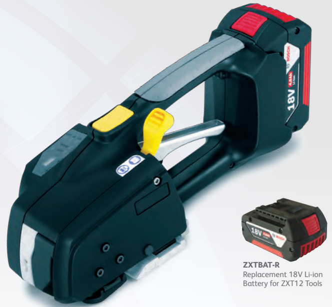
ZXTBAT-R Replacement 18V Li-ion Battery for ZXT12 Tools